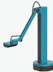
VZ-X Wireless Document Camera

Visualize physical textbook or objects and display them on a big screen. IPEVO cameras output standard USB UVC format, compatible with and can be used with IFP's built-in camera playback software, or IPEVO's Visualizer software can be installed on IFP for image playback.