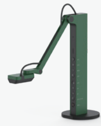
VZ-R Dual Mode Document Camera