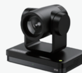
VC-Z4K UHD PTZ Camera

Enables clear capture of speakers using remote-controlled camera adjustment or AI automatic tracking.