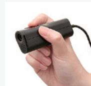
P2V ULTRA Object Camera

Experience P2V ULTRA handheld and multi-camera modes. Paired with IPEVO Visualizer for enhanced teaching demonstrations in the classroom and clear content sharing with remote learners.