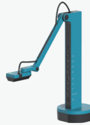
VZ-X Wireless Document Camera

IPEVO's solutions offer a remedy for the issue of teacher shortages. By integrating document cameras and the TOTEM series and VOCAL with a portable, simple setup, district-wide remote classes achieve clear video quality, providing an immersive learning experience.